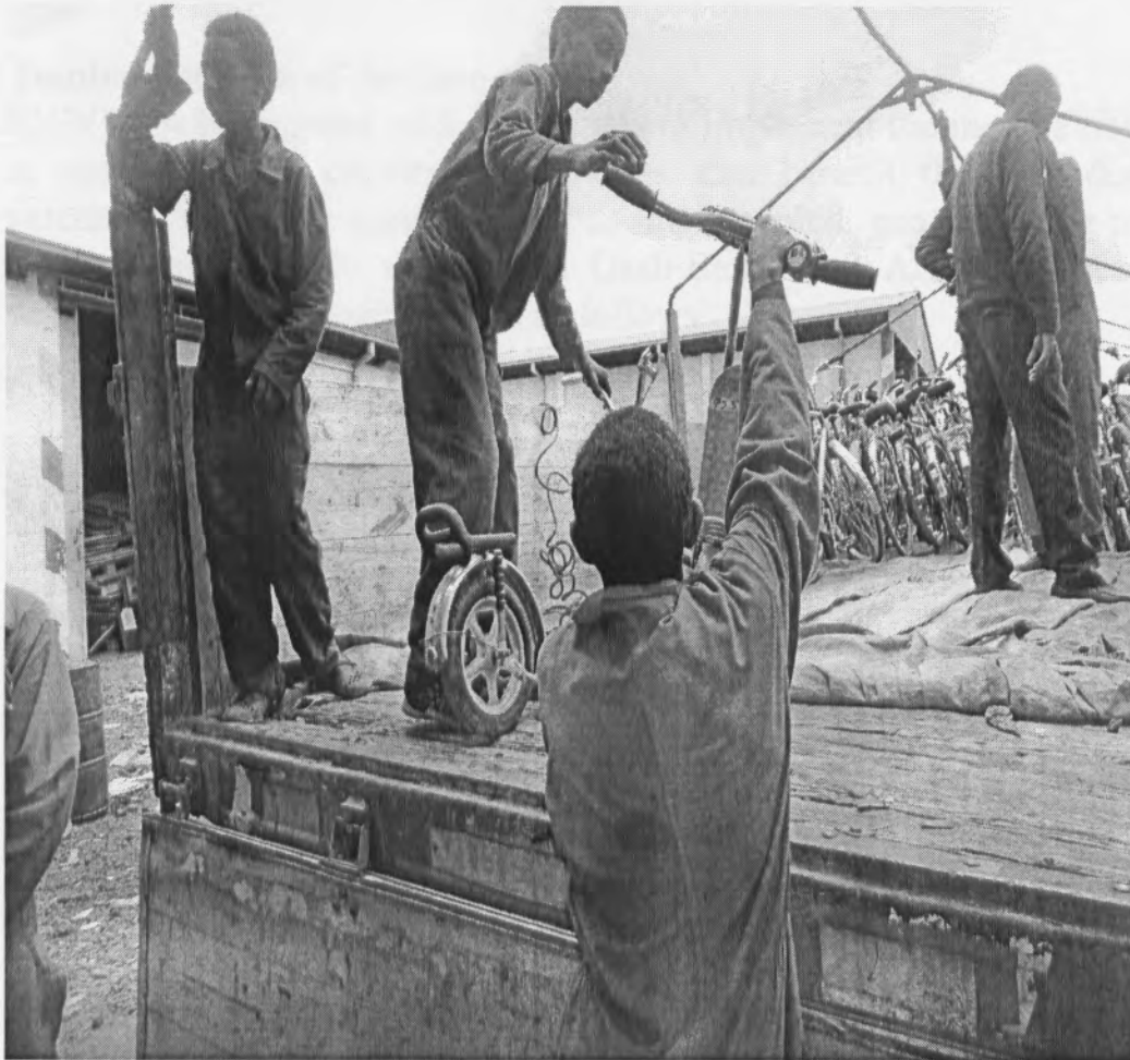
b) Child bike loaded in a truck after reassembly to be sold in one zone

As it can be observed in the table above the total sales of the 763 bikes is 2,098,784.00 Nakfa .